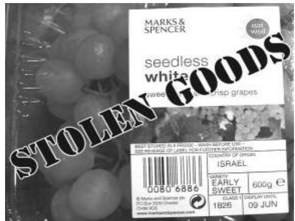
Boycott Israeli goods

When I was in Palestine, people asked over and over again for help to support them in their struggle to live in peace and dignity – help that as an individual I was unable to provide. But collectively we can make a difference, just as we did against apartheid in its South African version.