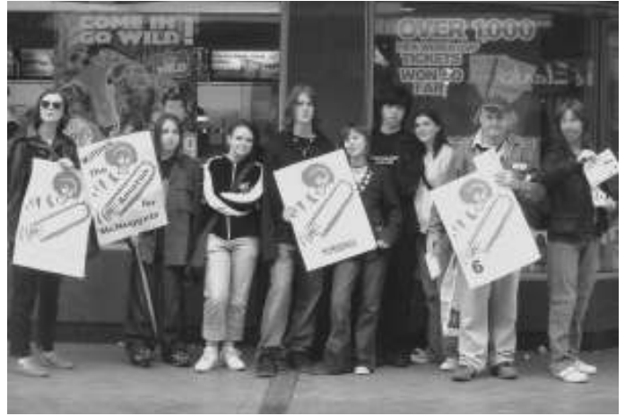
Some of the protesters outside McDonald's

Two of us hung the banner from the roof of the shops opposite McDonald's, while others outside the shop (restaurant isn't the right word for it) displayed placards, spoke to passers-by and handed out leaflets which explained McDonald's contribution to the destruction of the rainforest, as well as pointing out the health risks of eating fast food.