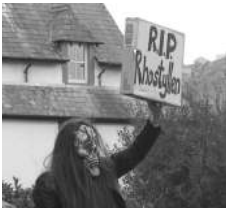
Rhostyllen campaigner against the housing development on Erddig

balance, a chance for our communities to recover from some of the dramatic changes that have taken place.