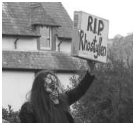
Rhostyllen campaigner against the housing development on Erddig

balance, a chance for our communities to recover from some of the dramatic changes that have taken place.