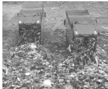
Lorries tipping at Hafod

Thirdly, our appeal to Europe over desecration of the Special Area of Conservation for Europe is languishing in Brussels despite being put forward by the European Parliament.