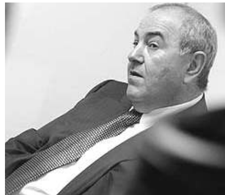
Iyad Allawi - Head of Iraq's "Interim Government"

Allawi is likely to become Saddam's successor and will reinstate most of his security apparatus. Iraqis will continue to live in fear, but the West will continue to claim that life is "better" than it was under Saddam. That perhaps will be their old ally's final gift to them.