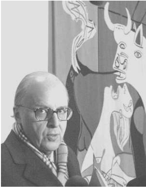
John Negroponte - US Ambassador to Iraq

JOHN NEGROPONTE was hand picked by President Bush to head the 2000-strong embassy in Iraq following the "handover of sovereignty" to the Iraqi people. He is effectively the most powerful man in the country. As an aide to Henry Kissinger he was responsible for chemical warfare in Vietnam, a campaign that cost many thousands of civilian lives and still continues to claim them today. In 1981-85 he was US ambassador in Honduras, presiding over a period of intensive US military support for the Honduran government in a campaign to suppress the peasants, socialists, unions and independence activists which resulted in tens of thousands of killed and recorded human rights violations running at 4000 a year. Imposing democracy on Honduras required an increase in US military aid from $4m to $77.4m. Negroponte was instrumental in setting up bases for the Contras in Honduras to conduct their murderous campaign in Nicaragua, and in supporting the death squads in El Salvador who at their height were killing 40,000 a year. He personally covered up the murder of 32 American nuns who were tortured and thrown to their deaths from helicopters. From 1989-93 he was ambassador to Mexico where he ushered in the North American Free Trade Agreement which caused a million Mexican farmers to lose their land and livelihood.